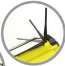
Fold Away Antenna