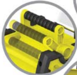
Fold Away Handle